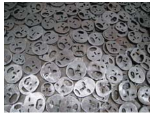
The Holocaust, Jewish Museum, Berlin