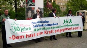
50th Anniversary ARSP