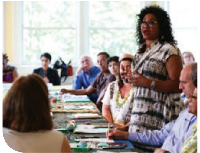
Equitable and Just Climate Platform

Our vision aligns with the Equitable & Just National Climate Platform that centers economic and racial justice. With core leadership from leaders in the environmental justice movement, 346 organizations have signed onto the platform.