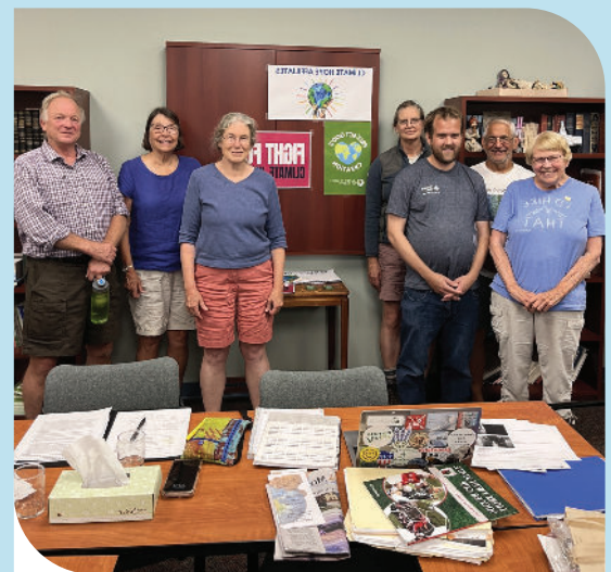
Concord, New Hampshire Climate Hope Affiliate Meeting