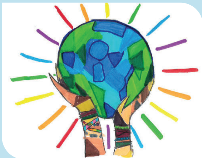
Charlotte, 12-Years-Old, 2024 Winner Glenside UCC, Glenside, PA