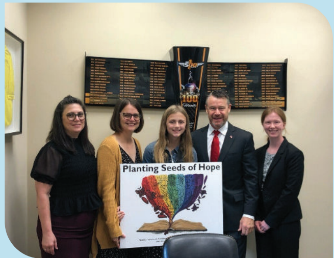
Natalie with Senator Todd Young (R-IN)