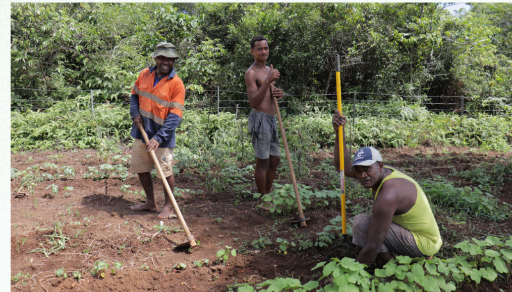
Workers from the Lomana Na Vulagi Eco-Farm & Training Centre, Fiji

The PCC believes strengthening the capacity and agency of Pasifika communities not only makes them more resilient in the face of both natural threats and exploitation from powerful nations, but the Vulagi Farm is rooted in the conviction that renewing the land and the indigenous spirit of the Pasifika is vital to the future of island peoples and their way of life.