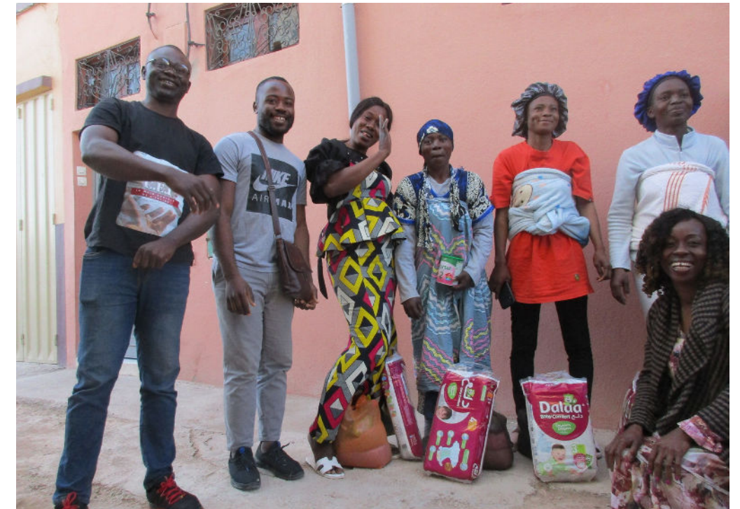
Migrant beneficiaries with the CEI team, near Agadir, Morocco