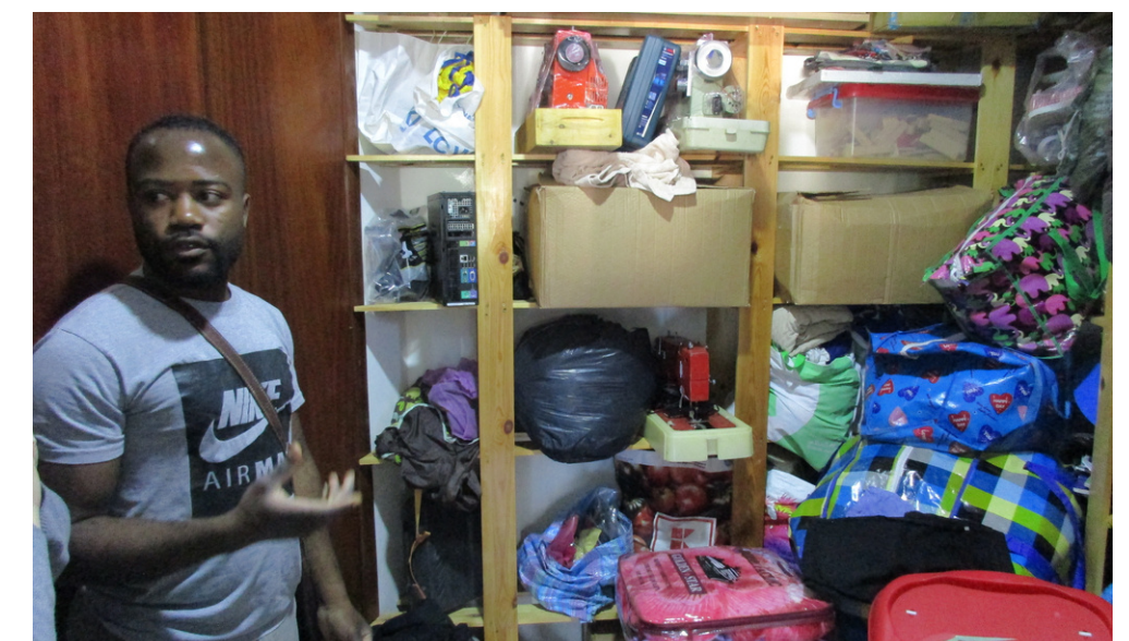
Local CEI coordinator in Agadir, Morocco