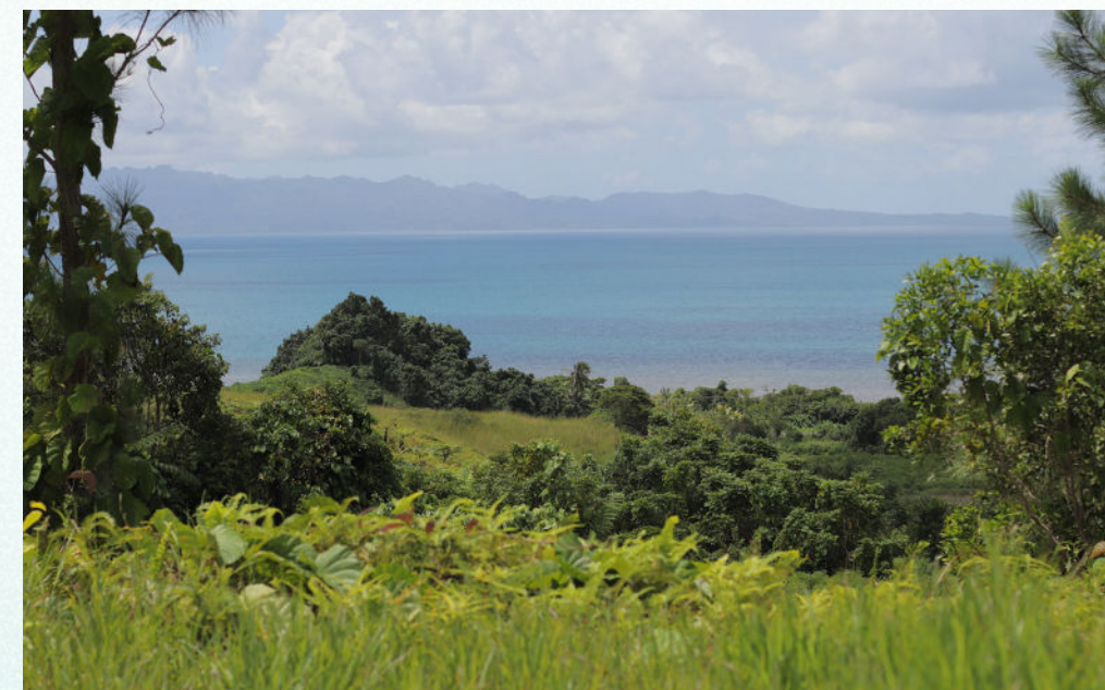
Lomana Na Vulagi Eco-Farm & Training Centre, Fiji