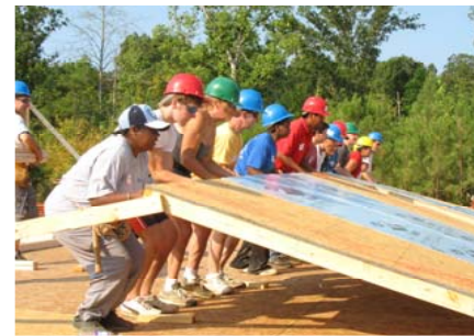
Habitat for Humanity wall-raising, United Church of Chapel Hill (NC)

As Christians we sing the hymns of justice, equality, and unity; we pray for the well being of all God’s children; and we continue our activities to feed the hungry and house the homeless. But all the while we watch the gap between rich and poor in our own nation and in the world become ever wider, with many millions left in