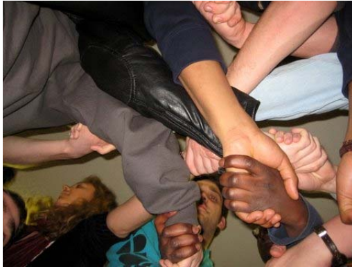
Making Connections for Life