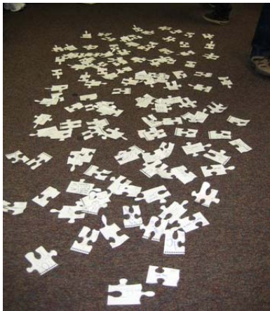
Reflecting on Motivations for Service. It's like fitting together lots of puzzle pieces.