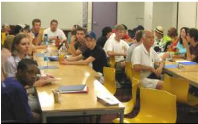
HIV seminar participants

R iverside Church Global HIV and AIDS Ministry, AIDS Service Center New York City, the United Church of Christ HIV and AIDS Network and Conscious Contact of New York had the opportunity to collaborate with The Presbyterian United Nations Office by hosting the New Providence Presbyterian Church of Maryville, Tennessee in a week-long seminar mission program from 7-10 July 2008. The program, entitled, "Living the Goals" is a combination classroom and interactive ministry educational experience intended to introduce youth to questions of urban poverty through the lens of the Millennium Development Goals (MDGs).