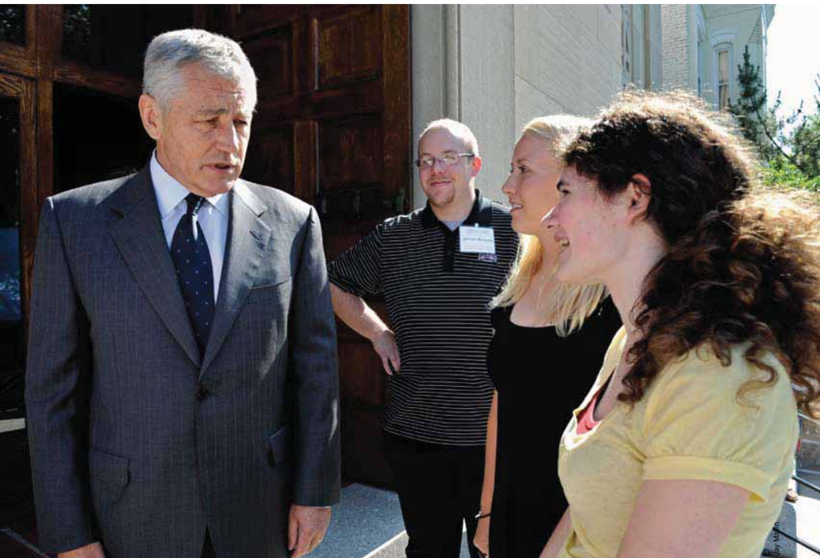
Sen. Chuck Hagel (R-NE) meets with Bread members during the 2008 Lobby Day.

“As people of faith we are called to show compassion, love kindness, and do justice. When we doubt our place in the political process, we need only recall the words of Jesus appealing to people to care for the common good. Bread for the World’s 2009 Offering of Letters makes a similar appeal to our nation’s leaders, encouraging them to focus our foreign assistance programs on overcoming hunger and poverty around the world.”