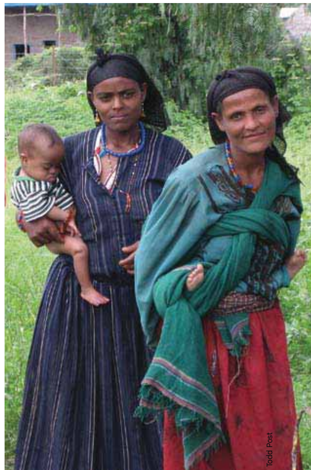
Ethiopian women like these lined up daily in 2008 to receive food assistance from abroad, a year when the jump in food prices stretched their limits to feed their children.