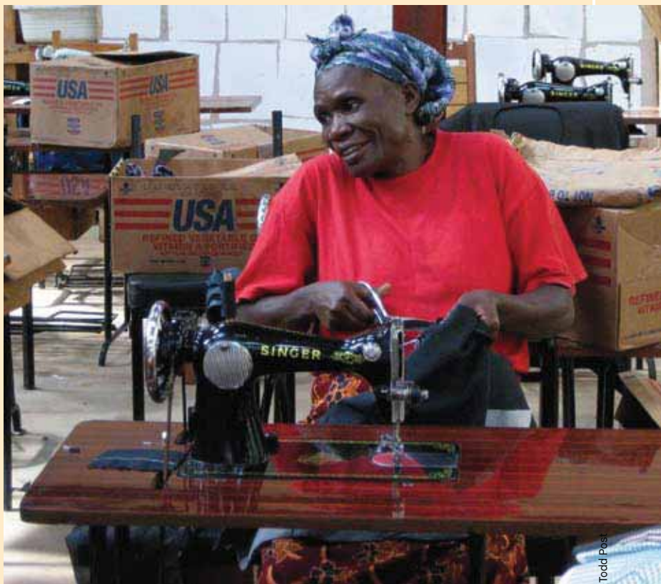
At the AMPATH Imani Workshop, a woman on anti-retroviral medication is now well enough to learn new livelihood skills.

AMPATH has the right approach, what they describe as “building a road and following it.”